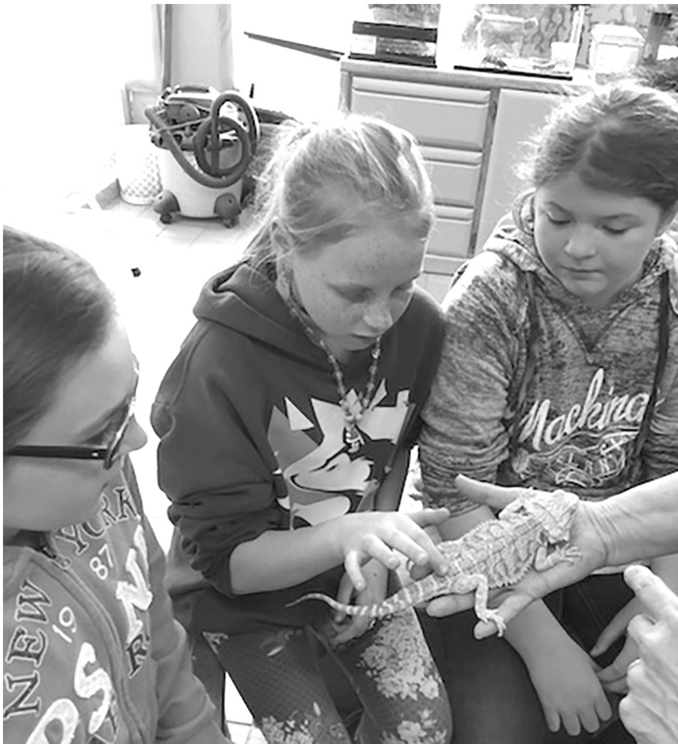
This year's middle/high school Lancer Leap classes include; canoe building, forest ecology, riddle making, Quidditch, Zumba, Yoga, mystery literature, theater, LEGO architecture, robotics, STEAM and sports, and many more.

community event called the "Lancer Leap Showcase." At the showcase class projects are on display as well as live performances. This year's performances will include live theater, a canoe auction, a Zumba performance, and more. The Lancer Leap Showcase is scheduled for the evening of June 7 with doors opening at 5:00 PM and