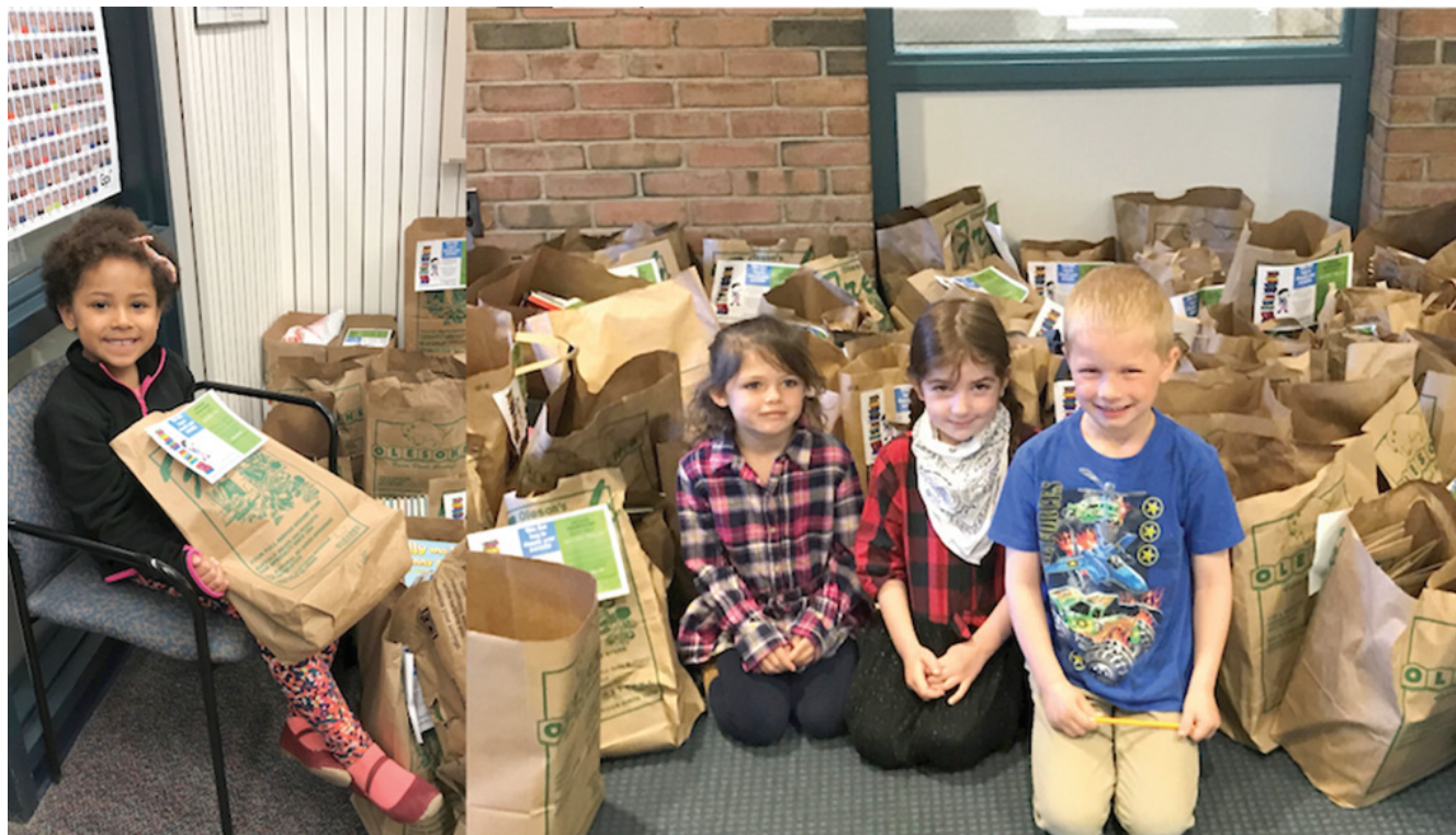
Elementary Students with donated books for Great Start FreeCycle Book Project.